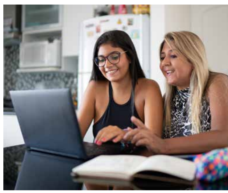
* Only applies to domestic students and international students approved through the Sunshine Coast School Alliance. Other international students pay full fees, visit usc.edu.au/fees to check the fee.

You can apply for a scholarship when you submit your continuing Headstart application form.