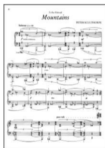
Figure 1 Mountains

Reproduce music notation as a figure. Pinpoint divisions as given in the score (e.g. page, movement, bar/s). Include online source details if citing a version of the score available online.