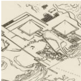
Figure 1 Khafre's funerary complex Source: Ancient Egypt Research Associates (2014, p. 1) Include page number.