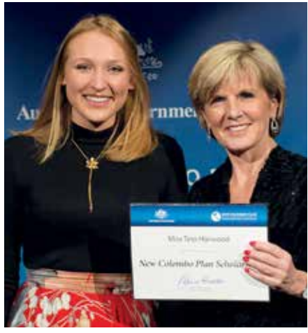
Foreign Affairs Minister Julie Bishop presents Tess Harwood with a New Colombo Plan scholarship.