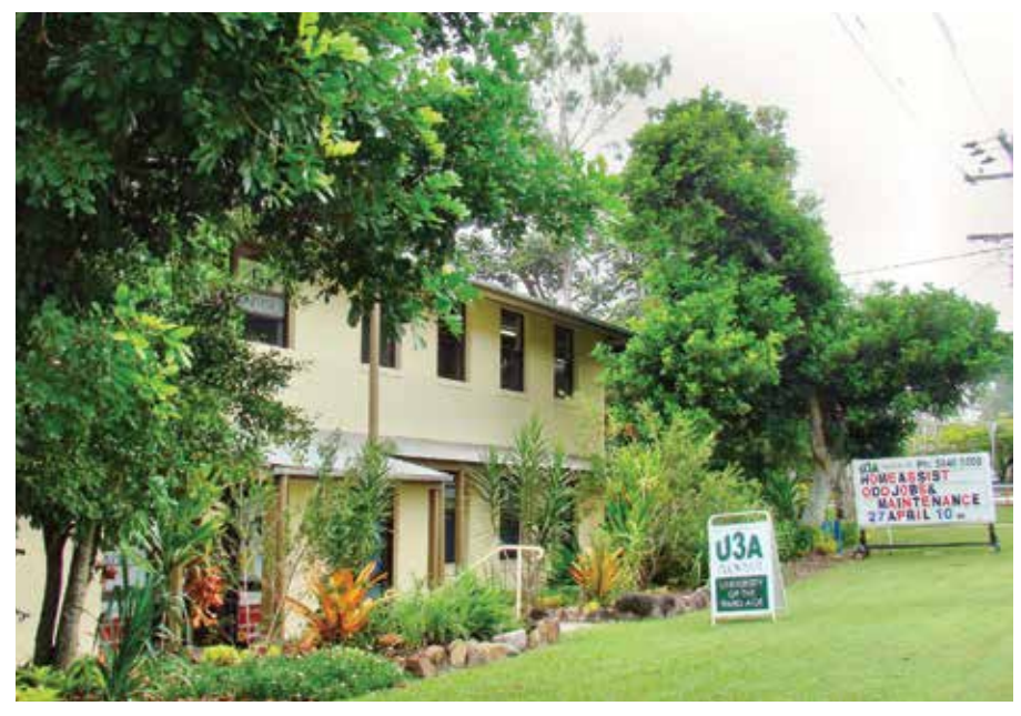
The two-storey commercial property at Tewantin that has been donated to USC.