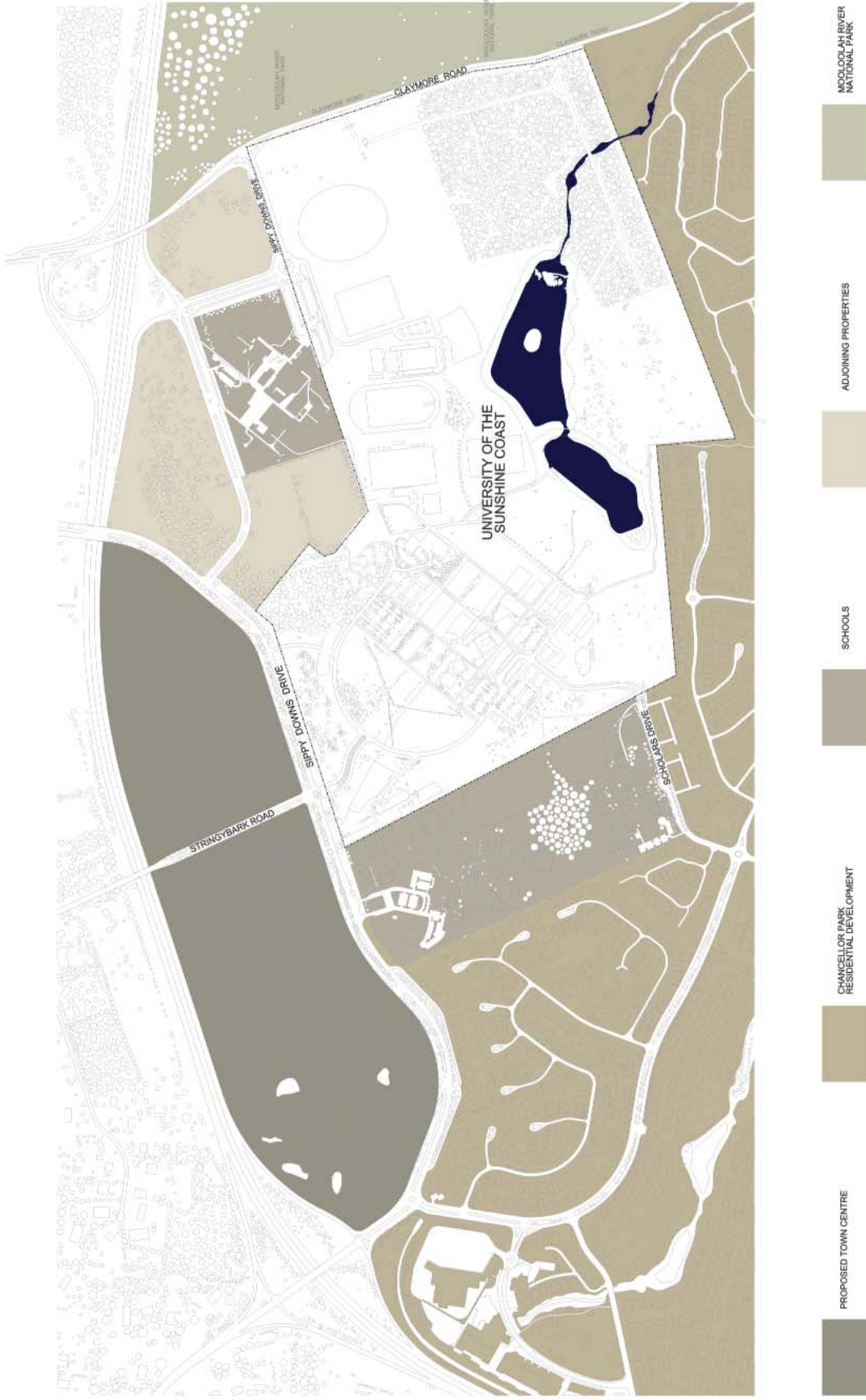
Diagram | 3.3.2