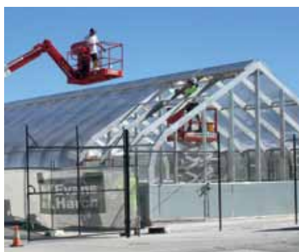
■ Workers construct the CSIRO glasshouse at USC.