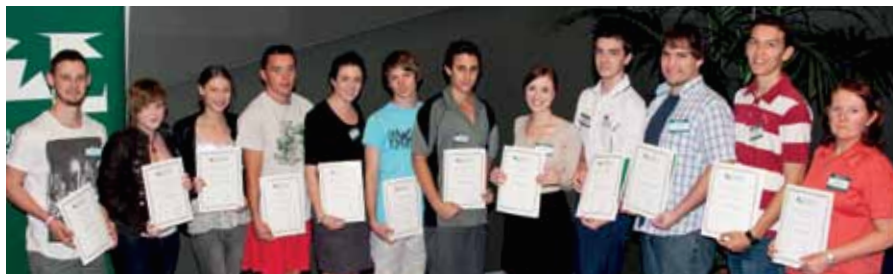
■ Recipients of the first round of USC Study Support Bursaries display their certificates.

THE first USC Study Support Bursaries, funded by pooled community donations, were presented to 25 students in October.