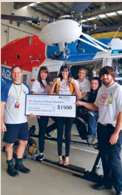
USC students present $1,500 to the AGL Action Rescue Helicopter Service crew.

THE community spirit of a team of Public Relations students from USC has been recognised by one of the Sunshine Coast's key emergency services.