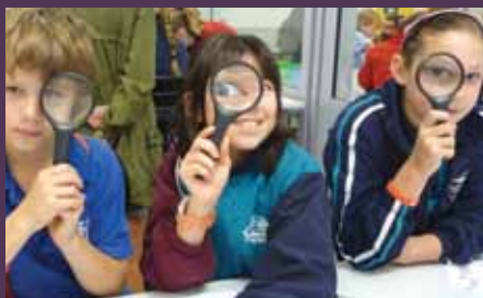
Primary students check out the science expo.