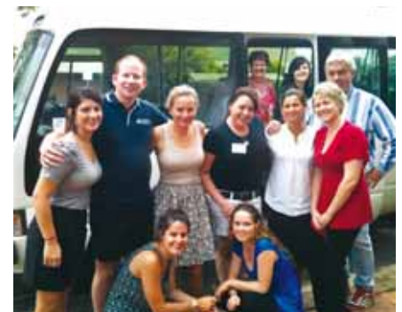
■ Education students prepare for the 'Coast to Country' road trip to rural and remote schools.

USC received funding from the Tim Fairfax Family Foundation to help fund the initiative. This foundation assists charitable organisations that support the needs of communities in rural, remote and regional areas.