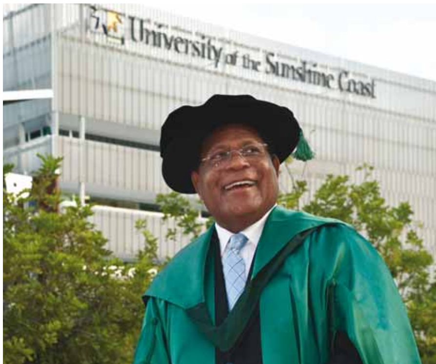
■ His Excellency Barnabas Suebu, the Governor of the Indonesian Province of Papua.