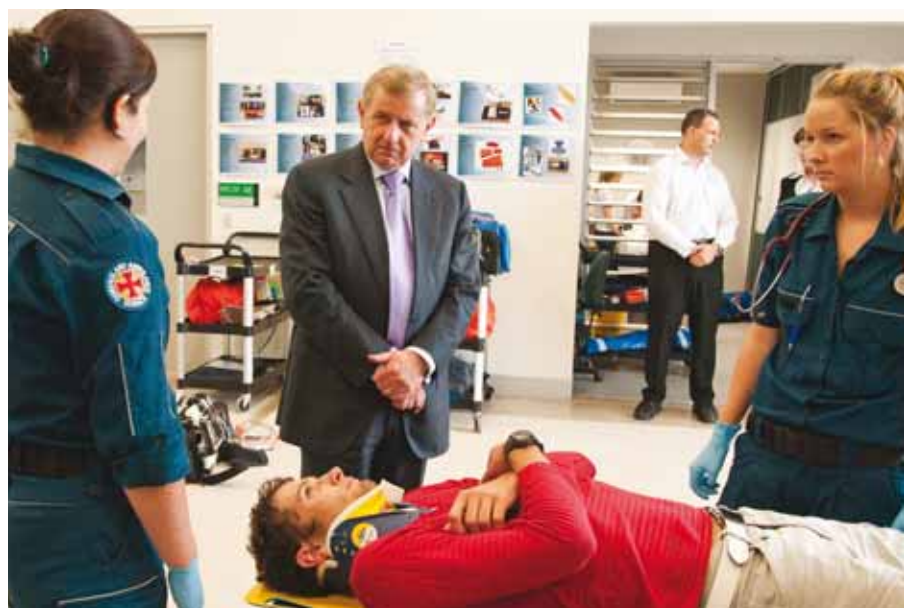
■ Paramedic Science students chat with Federal Minister Simon Crean after he opened USC's Engineering and Science Training Facility in May.

The 1050 square metre facility features specialised equipment and large, open spaces suitable for medical emergency simulations and a wide variety of engineering tests and experiments. It also has several laboratories and tutorial rooms.