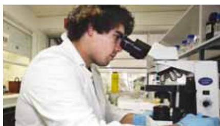
■ Funding successes will help USC develop its research capacity.

He said the University's Research Futures Project was an integrated package of initiatives with research partners comprising