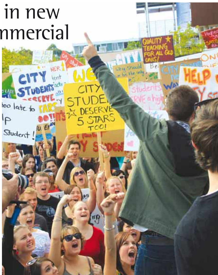
■ Hundreds of students enthusiastically join in a mock rally which was filmed for USC's latest TV commercial.

It also will feature on YouTube, where it is expected to attract plenty of attention.