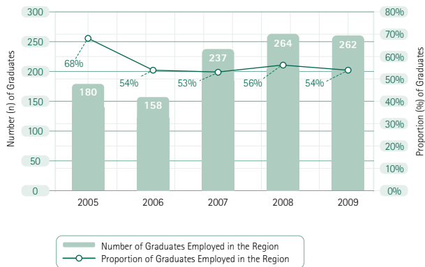
■ Number (n) and Proportion (%) of Graduates Employed in the Region